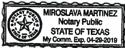
NOTARY STAMP / SEAL